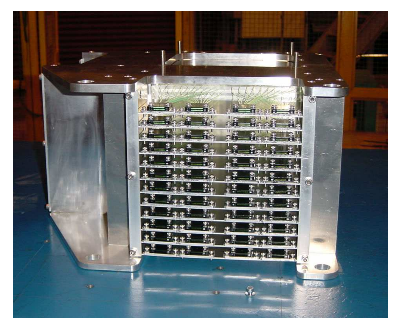
Figure 1: The test module

There has been an increased demand for very high granularity calorimetry for precise determination of the reaction final state. For this purpose, we have been developing a scintillator-strip array EM calorimeter for linear collider experiments. Figure 1 is a photo of the test module. This scheme eventually requires huge number of optical readout channels, and has become possible owing to recent progresses in EBCCDs or SiPM. Obtained shower direction resolution of 54mrad at 4GeV, as shown in Fig.2, is fairly good as a dense (non-gaseous) calorimeter.